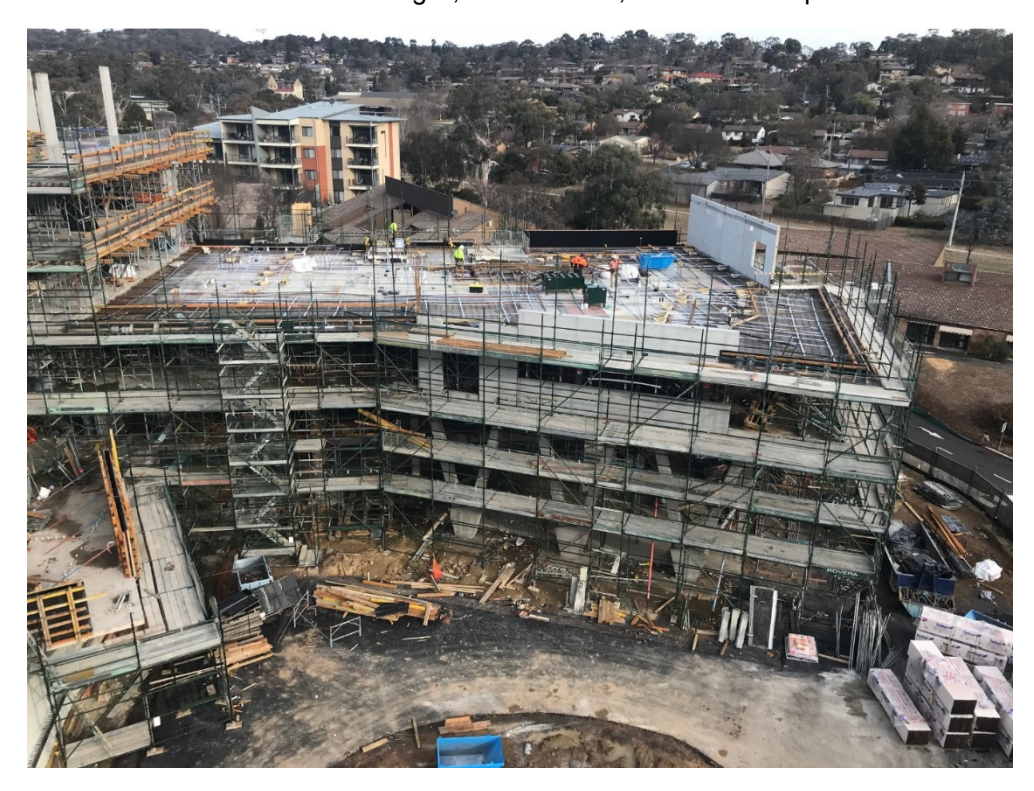
Building C Level 2 suspended deck formed, steel reinforcement and stressing installed.