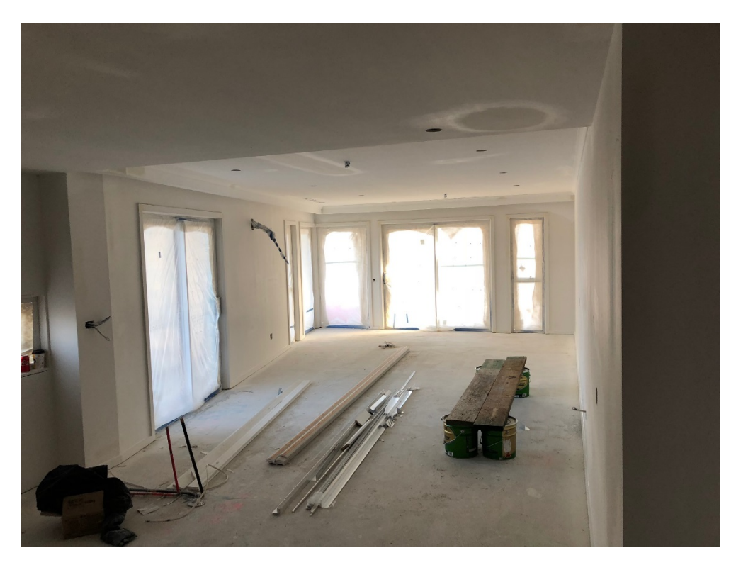
Apartment 47 Building A ground floor